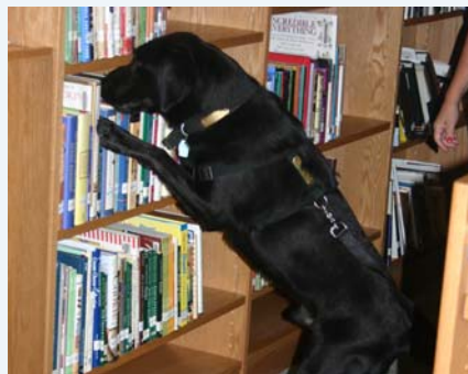
Puma, a Labrador retriever owned by Interquest, demonstrated his ability to sniff out contraband at a recent school board meeting. Interquest makes periodic, unannounced visits to all four secondary schools as part of DASD’s “Safe Schools” plan.